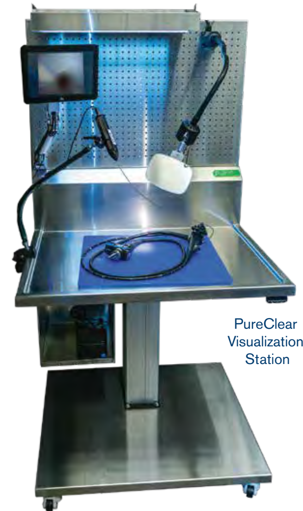
PureClear Visualization Station