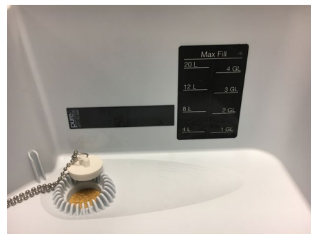
Proper placement of thermometer strip in Sink Insert, any size

For best results, place the thermometer strip near the black, max fill sticker. Follow instructions above to ensure the strongest bond on the insert. Peel the adhesive backing. The adhesive is very sticky; it will not be easily removed once placed. Place your thermometer strip as shown in the photo, right . Carefully peel off the clear protective coating from the front of the thermometer strip.