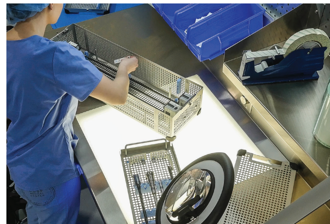
Optional, integrated table lights enhance both wrap and instrument inspection.