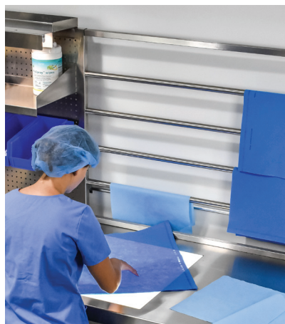
Pegboard and wrap rung options organize both traditional table accessories, and integrate wrap storage at the point of use.

No two prep and pack tables are created equal. From time and motion for worker productivity, to ergonomics and its impact on staff, to organization and its impact on turnover time and compliance, assembly tables require careful planning and consideration to ensure they meet each department's individual needs and objectives.