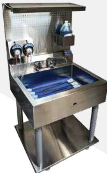
Minimally Invasive Reprocessing Sinks